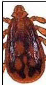
Brown dog tick

Lone Star Tick lives in the eastern part of Kansas and south east states along with the brown dog tick.